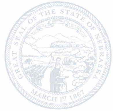
Jim Pillen, Governor

In addition, 67 projects that the Nebraska Resources Development Fund helped to build have and will continue to protect the state's natural resources and, although often taken for granted, have also produced significant recreation and economic benefits for our citizens. These projects have leveraged significant federal and local funding to develop, preserve and maintain the state's water, and related land resources, including: programs and projects for the abatement of pollution; reduction of potential flood damages; reservation of lands for resources development