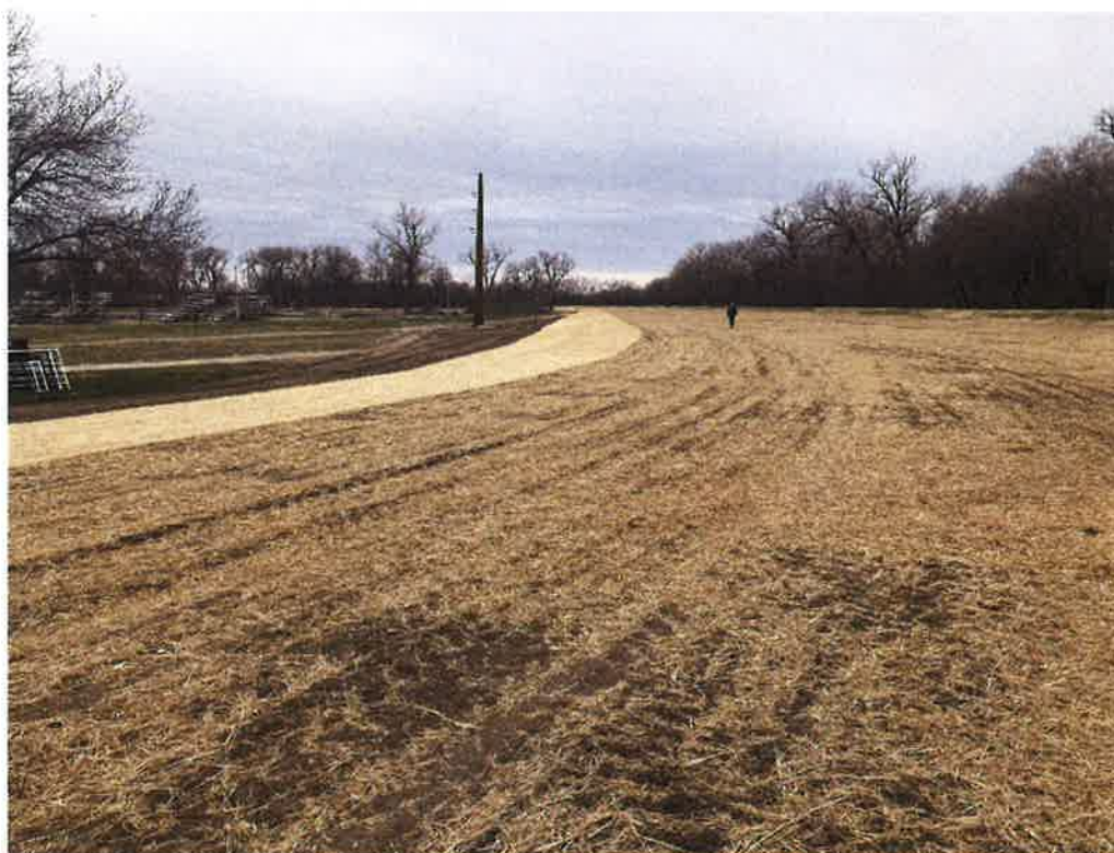
West Point Levee Seepage Berm Construction: Seeding and Matting