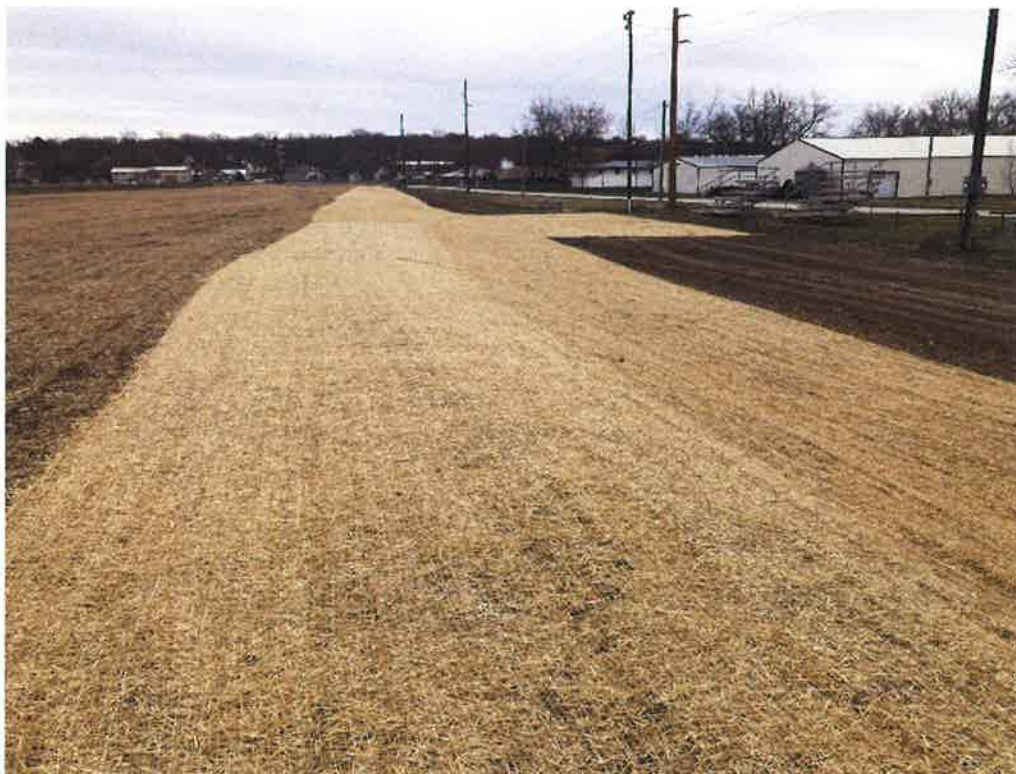
West Point Levee Seepage Berm Construction: Seeding and Matting