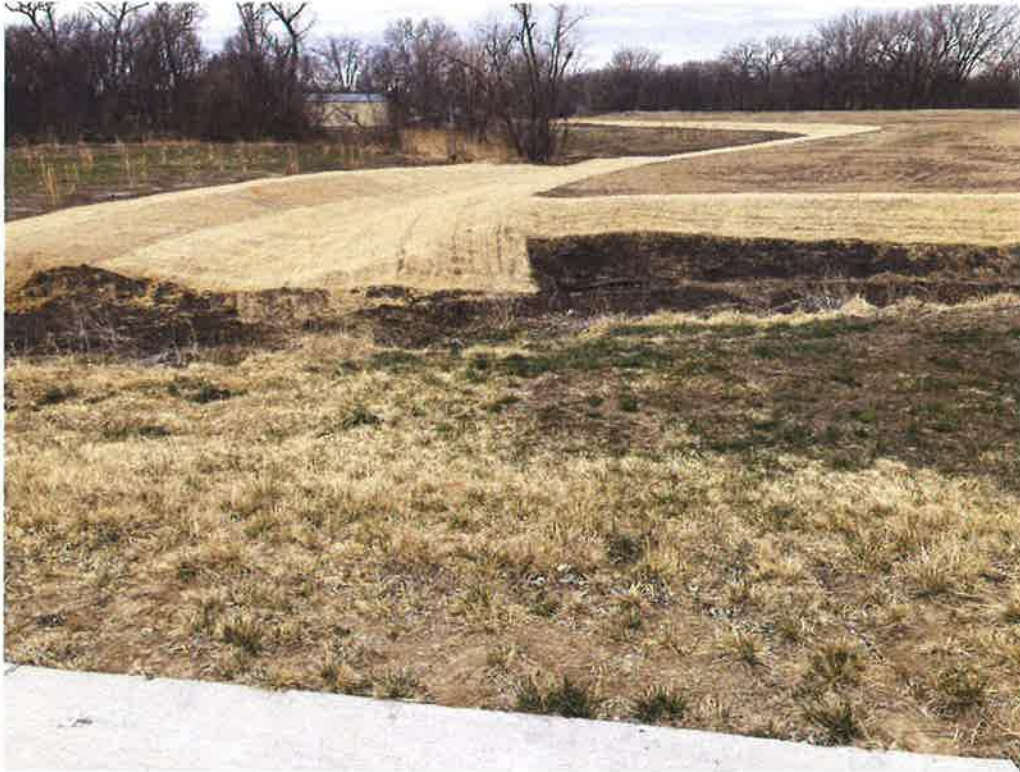
West Point Levee Seepage Berm Construction: Seeding, Matting, and Tree Mitigation